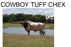
COWBOY TUFF CHEX